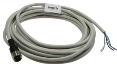
Cable to connect the EDS Distance Laser Sensor.